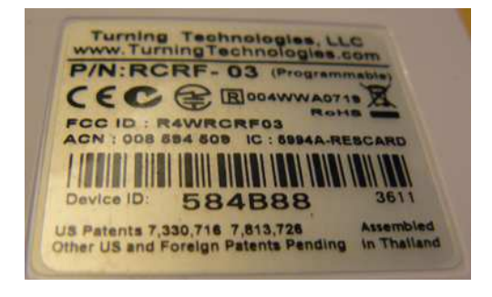
Figure 3: Location of Label on Turning Technology clickers

(h) Upload file. There may be correction steps you need to go through letting you choose users for unregistered clickers, etc.. You will need to deal with these steps to finalize the upload and scoring.