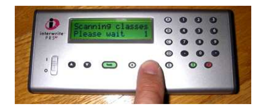
Figure 4: Interwrite Step 1