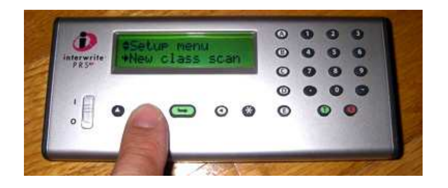
Figure 6: Interwrite Step 3