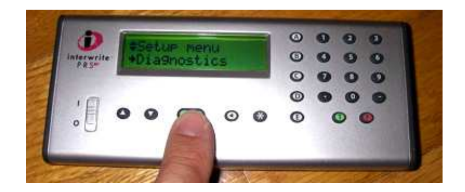
Figure 7: Interwrite Step 4