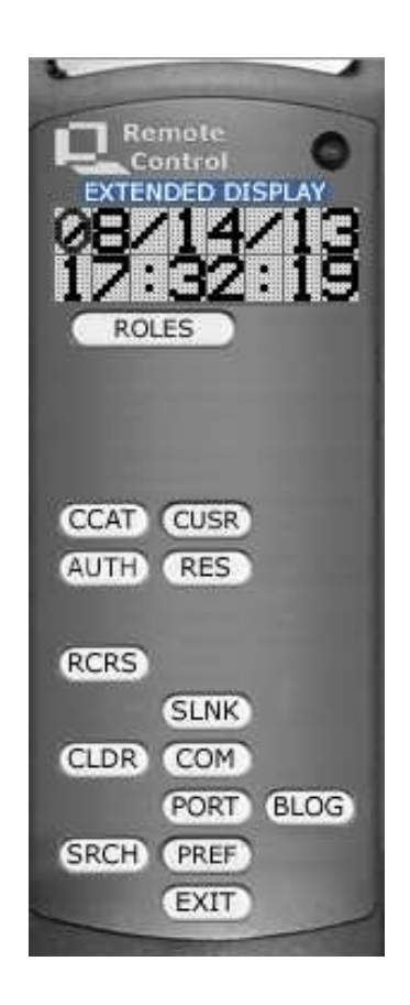
Figure 1: Author Remote Control