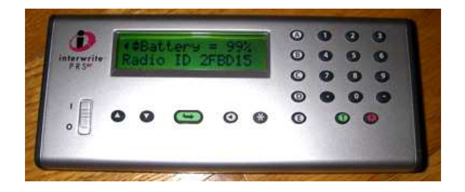
Figure 8: Interwrite Step 5