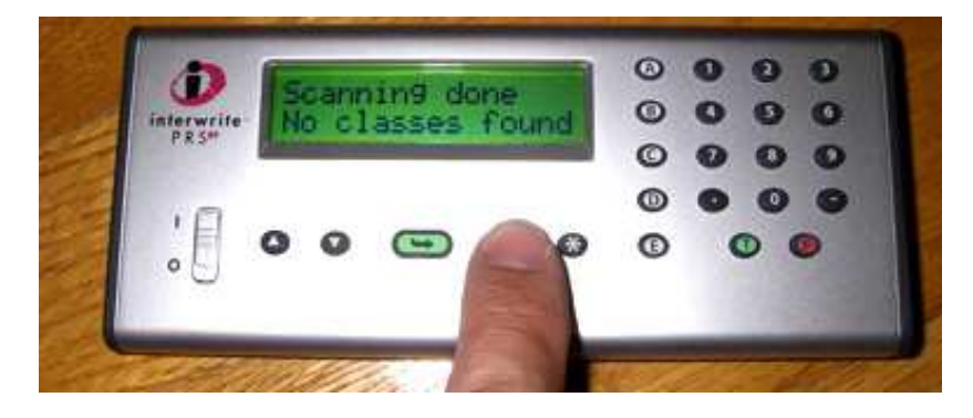
Figure 5: Interwrite Step 2

Interwrite RF : on the RF version of the Interwrite clicker, you need to go through a number of steps. When you first switch it on, it will look for a class. Cancel that by pressing the asterisk key.